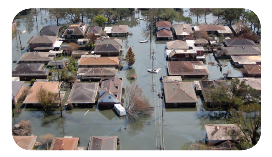
Figure 2. Neighborhoods in New Orleans, La., inundated following levee breaches after Hurricane Katrina in 2005.

Figure 1. Lake Pontchartrain and Greater New Orleans, La. Gray-shaded area denotes areas of New Orleans that flooded because of the effects of Hurricane Katrina in 2005.