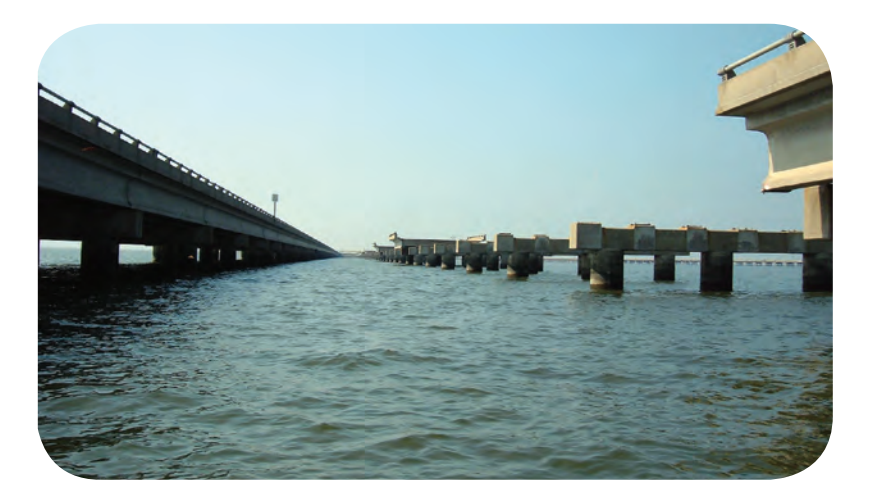
Figure 6. Sections of the Interstate 10 Twin Span Bridge, La., displaced by Hurricane Katrina's storm surge.

Figure 5. A U.S. Geological Survey field team prepares to launch a boat prior to a day of environmental sampling during the Lake Pontchartrain, La., survey.