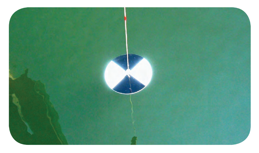
Figure 7. A Secchi disk is deployed to determine Secchi depth, an indicator of water clarity. The 8-inch (20.5-cm) disk is lowered through the water column to the point where it disappears from sight; it is then slowly retrieved to the point at which it just reappears to mark the Secchi depth.

Figure 6. Sections of the Interstate 10 Twin Span Bridge, La., displaced by Hurricane Katrina's storm surge.