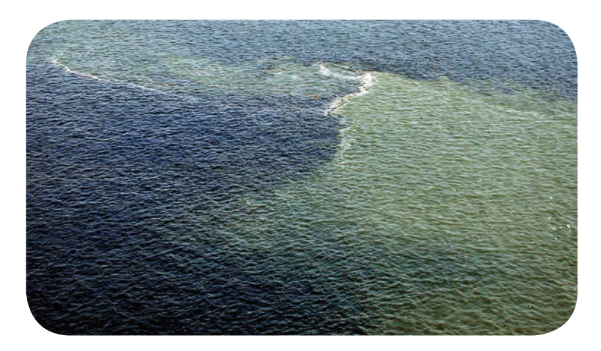
Figure 3. Plume from New Orleans, La., floodwater effluent pumped into Lake Pontchartrain, La., as a result of the flooding of the city by Hurricane Katrina.