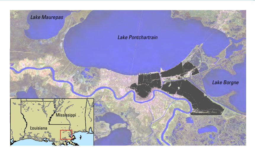
Figure 1. Lake Pontchartrain and Greater New Orleans, La. Gray-shaded area denotes areas of New Orleans that flooded because of the effects of Hurricane Katrina in 2005.

For the last decade, multiple resource agencies have partnered in a Federal program,