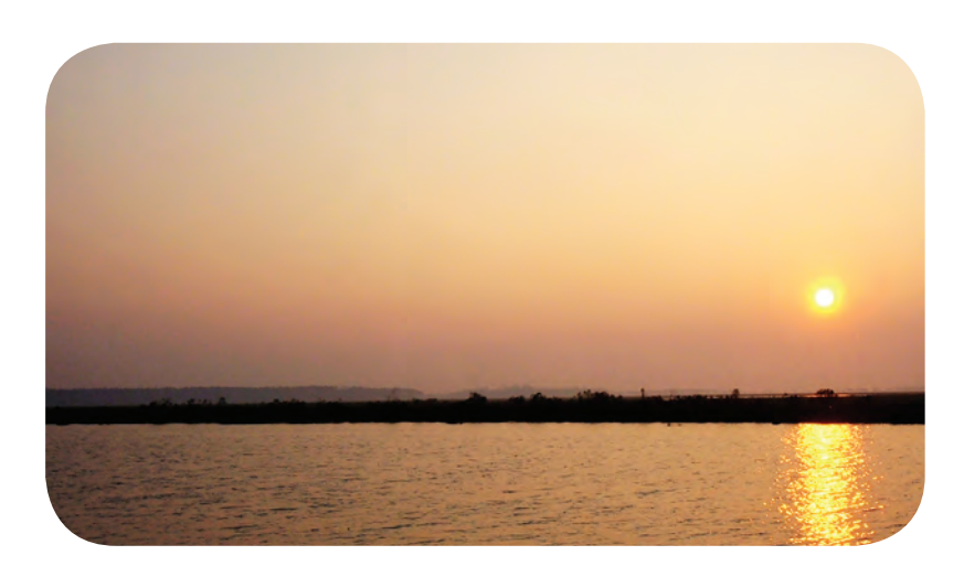
Figure 8. Tranquility on the north shore of Lake Pontchartrain, La., 1 month following landfall of Hurricane Katrina in 2005.

parameters (e.g., salinity) remained temporarily skewed from baseline values, after a month, the basic ecological components had coalesced to form a pattern of indicators very similar to those prior to the hurricane.